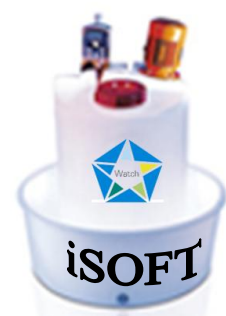
iSOFT® - intelligent Softener